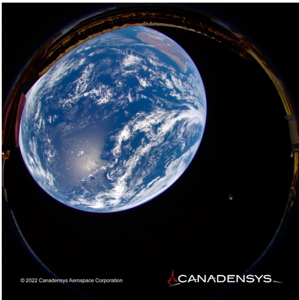
Image showing the Earth and the launch vehicle's second stage, taken about 2 minutes after the lander separated from the rocket.

The imaging system is mounted on the sides of the lander and will periodically take images throughout the mission.