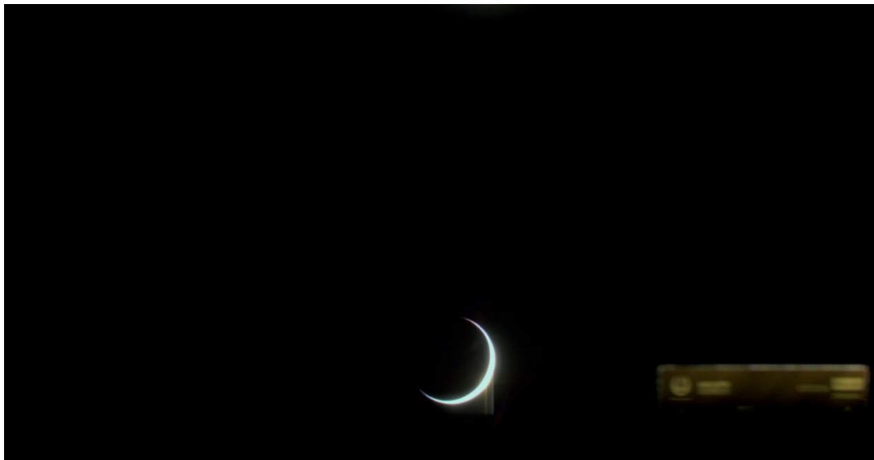
Image of the Earth about 19 hours after separation from the launch vehicle.

TOKYO—December 14, 2022—ispace, a global lunar exploration company, is pleased to announce that it has successfully taken images and transmitted them to the HAKUTO-R Mission Control Center (MCC). ispace's camera, located on top of the lander, will continue to record images throughout the mission. The lander continues to maintain a stable attitude and power supply.