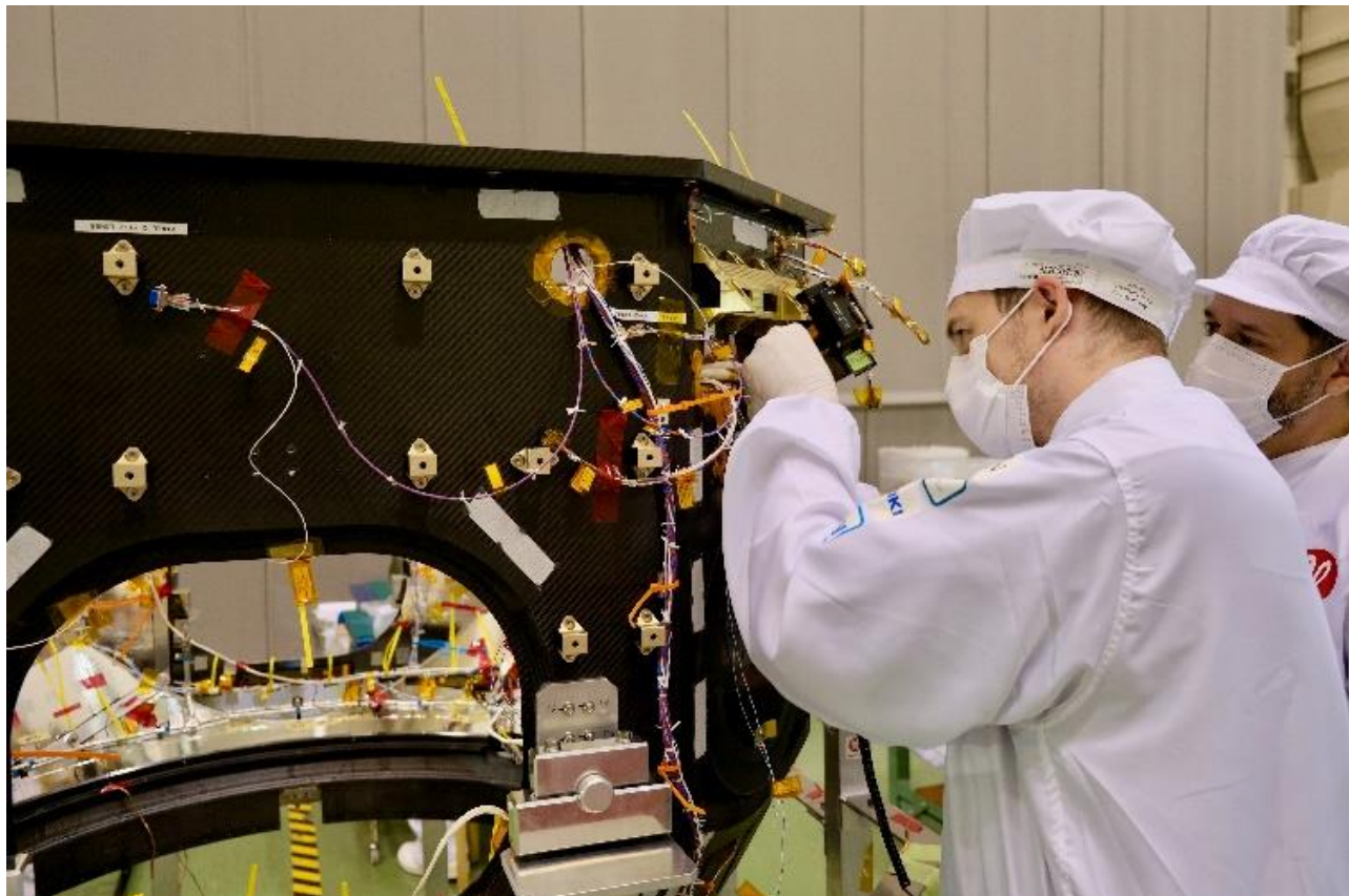
(ispace engineers assembling the Mission 2 RESILIENCE lander flight model at a JAXA facility in Tsukuba, Japan.)

The Mission 2 flight model will employ the same overall design as the Series 1 lander used during Mission 1, capitalizing its mission-proven performance. Based on the final analysis of the flight data from its HAKUTO-R Mission 1, improvements will be incorporated into the Mission 2 flight model to reflect necessary software validation, expansion of the landing simulation range, and additional field testing of landing sensors to further improve mission accuracy.