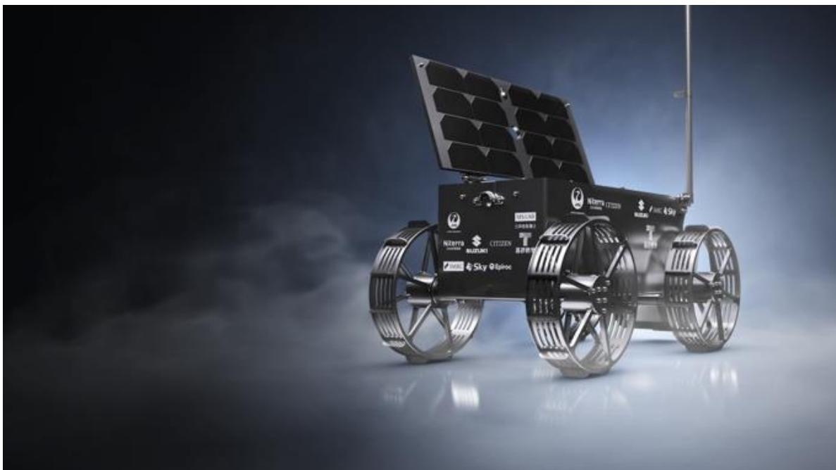
(A computer-generated image of ispace’s micro rover.)