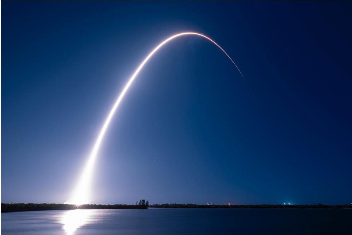
An image of the SpaceX Falcon 9 rocket launching with the RESILIENCE lunar lander on board.