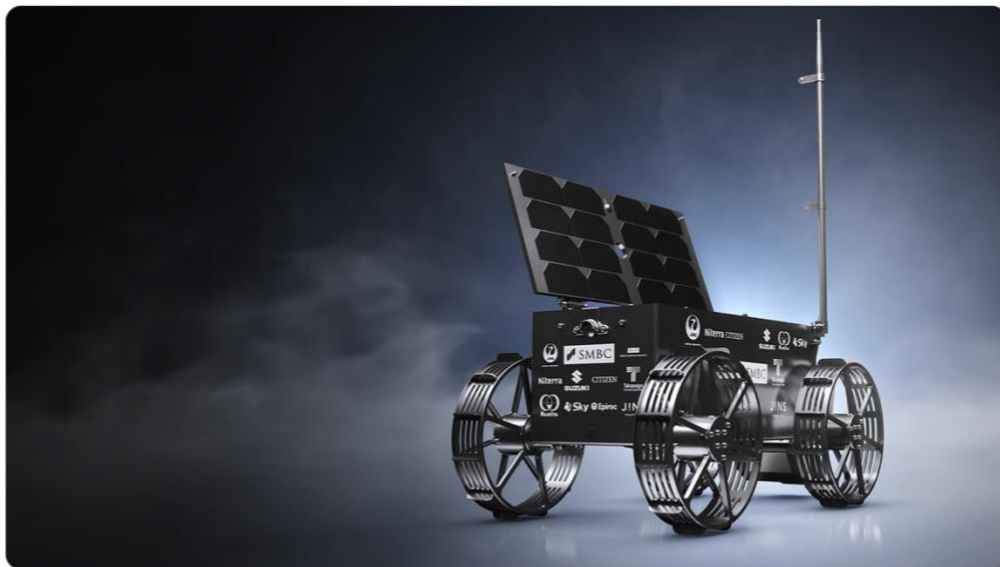
TENACIOUS Rover Documentary Episode 1

TOKYO—February 10, 2025—ispace, inc. (ispace) ( TOKYO: 9348 ), a global lunar exploration company, and the Luxembourg Space Agency (LSA) today announced the unveiling of a new mini-series on the development of the TENACIOUS micro rover, Europe’s first-ever lunar rover designed, manufactured, assembled, tested in Luxembourg and launched to the Moon aboard the RESILIENCE lunar lander.